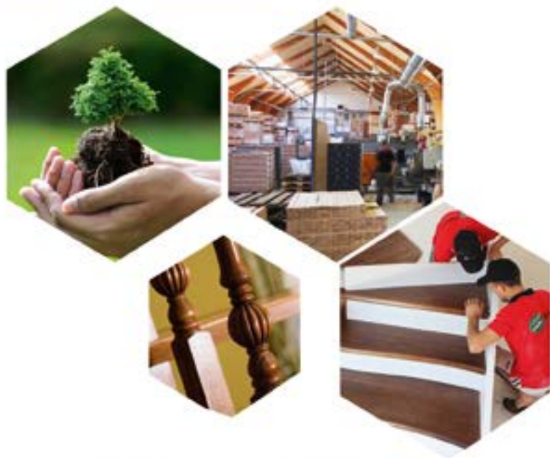
FACTORY OF WOODEN STAIRS

3-D design and manufacture of wooden stairs according to your wishes and taste, a wide range of ready-made solutions and a flexible price format. Installation of stairs at the facility according to 1 day. If you want non-creaky, durable, natural, as well as modern stairs, then you should come to us.