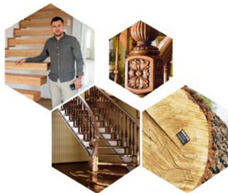
FACTORY OF WOODEN STAIRS

Proven materials and technologies for maximum durability and durability of products